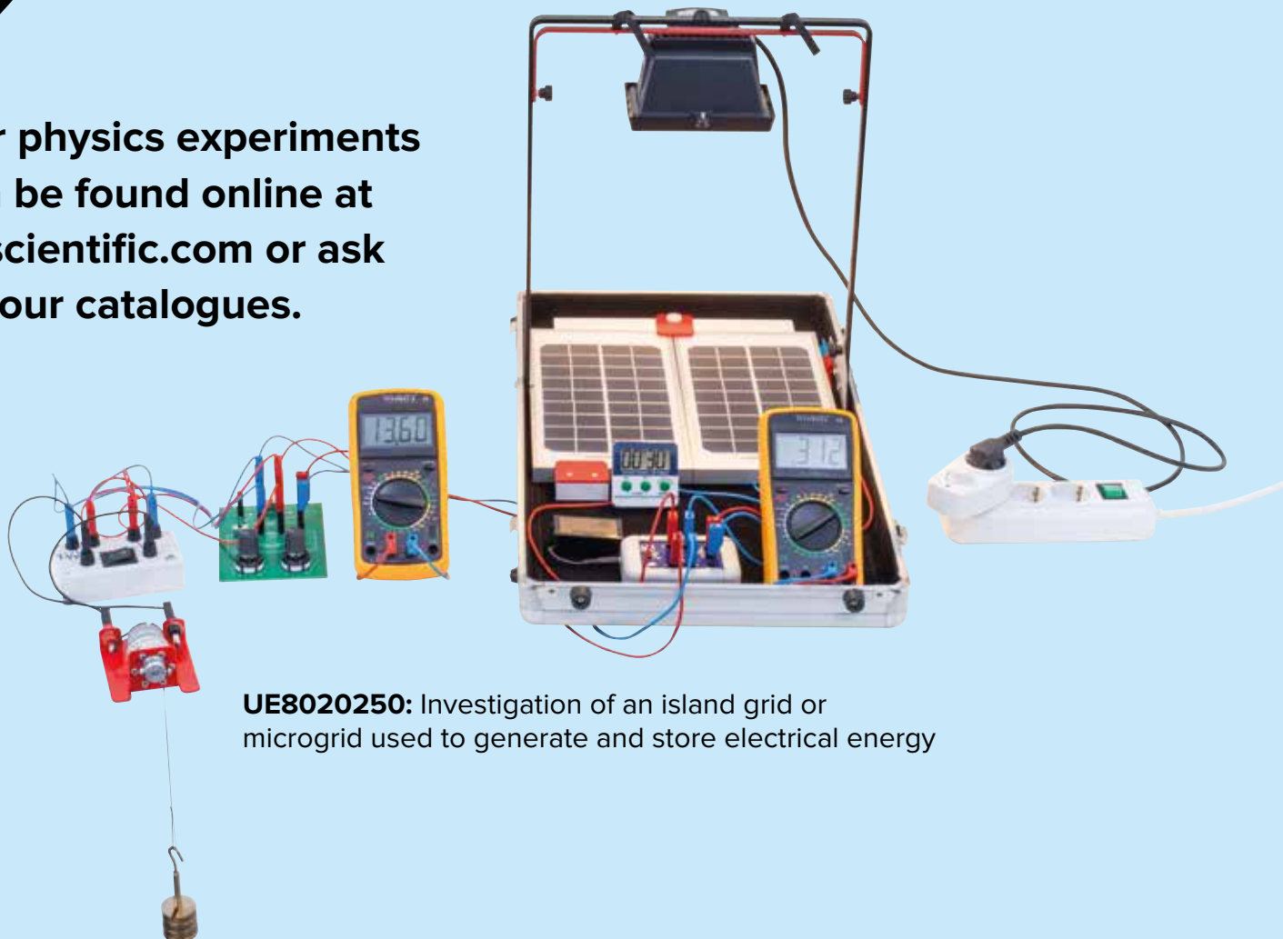
UE8020250: Investigation of an island grid or microgrid used to generate and store electrical energy

Our physics experiments can be found online at 3bscientific.com or ask for our catalogues.