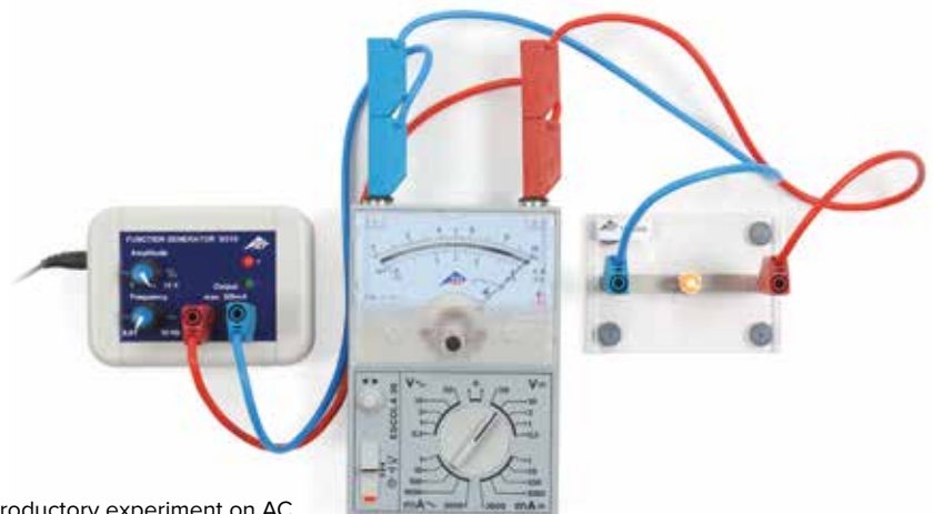
Introductory experiment on AC